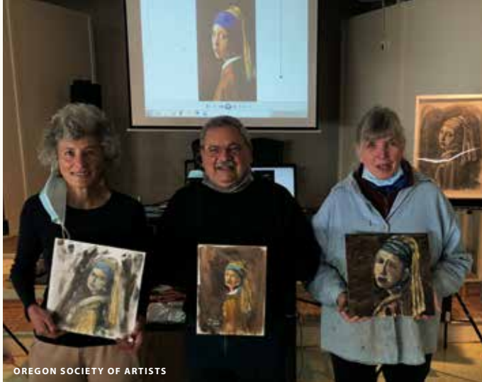
OREGON SOCIETY OF ARTISTS