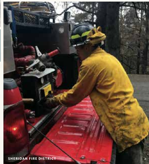
SHERIDAN FIRE DISTRICT