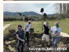
SAUVIE ISLAND CENTER