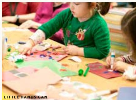
LITTLE HANDS CAN