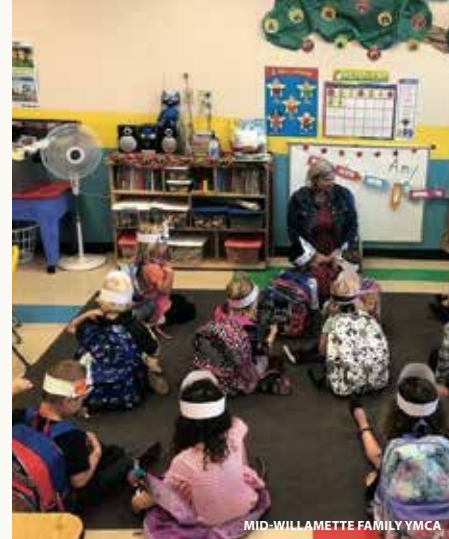
MID-WILLAMETTE FAMILY YMCA