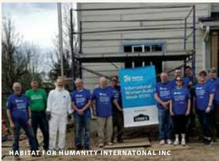
HABITAT FOR HUMANITY INTERNATIONAL INC