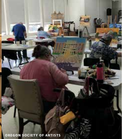
OREGON SOCIETY OF ARTISTS