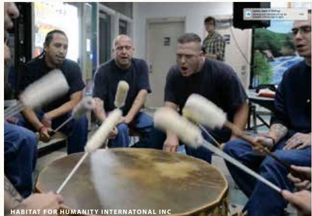
HABITAT FOR HUMANITY INTERNATIONAL INC