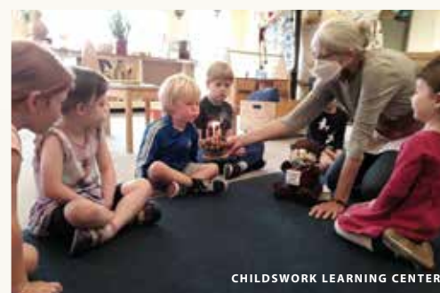
CHILDWORK LEARNING CENTER