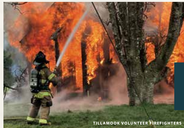
TILLAMOOK VOLUNTEER FIREFIGHTERS