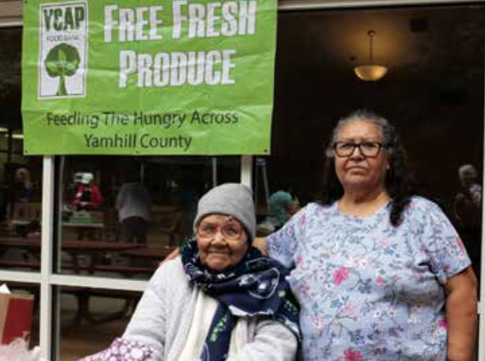
YAMHILL COMMUNITY ACTION PARTNERSHIP