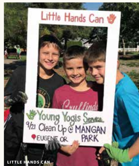
LITTLE HANDS CAN